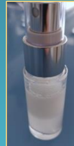
Spray bottle 15ml