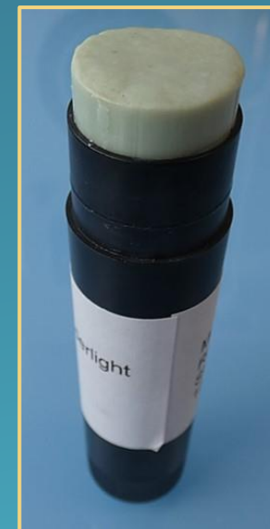
Black stick 15ml

It is easy to mould the sticks, they become hard at 45°C.